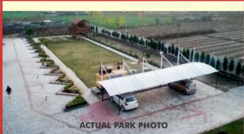
ACTUAL PARK PHOTO