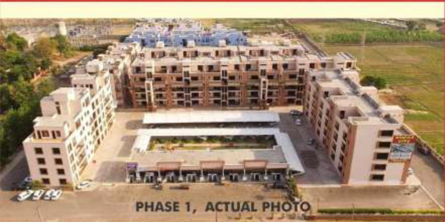
PHASE 1, ACTUAL PHOTO